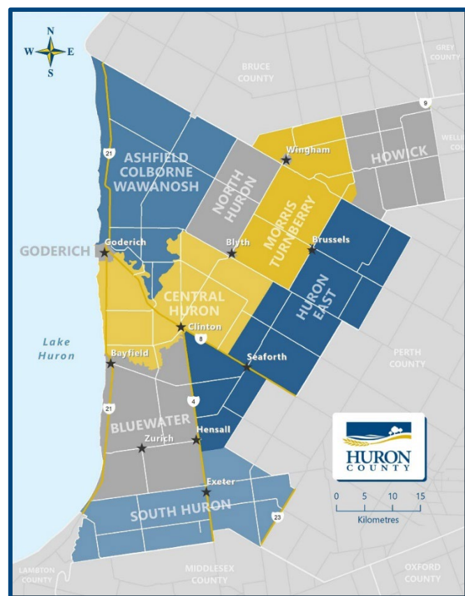
Figure 1 Huron County Map