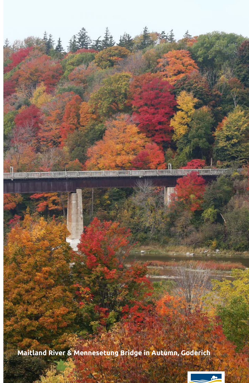
Maitland River & Mennesetung Bridge in Autumn, Goderich

Reconciliation is an ongoing process where we learn, adapt, and grow. For this reason, as we strengthen our relationship with Indigenous people and learn from past mistakes, this document, including the Land Acknowledgment, guidelines for use, and accompanying resources, is subject to change if/when more information becomes available.