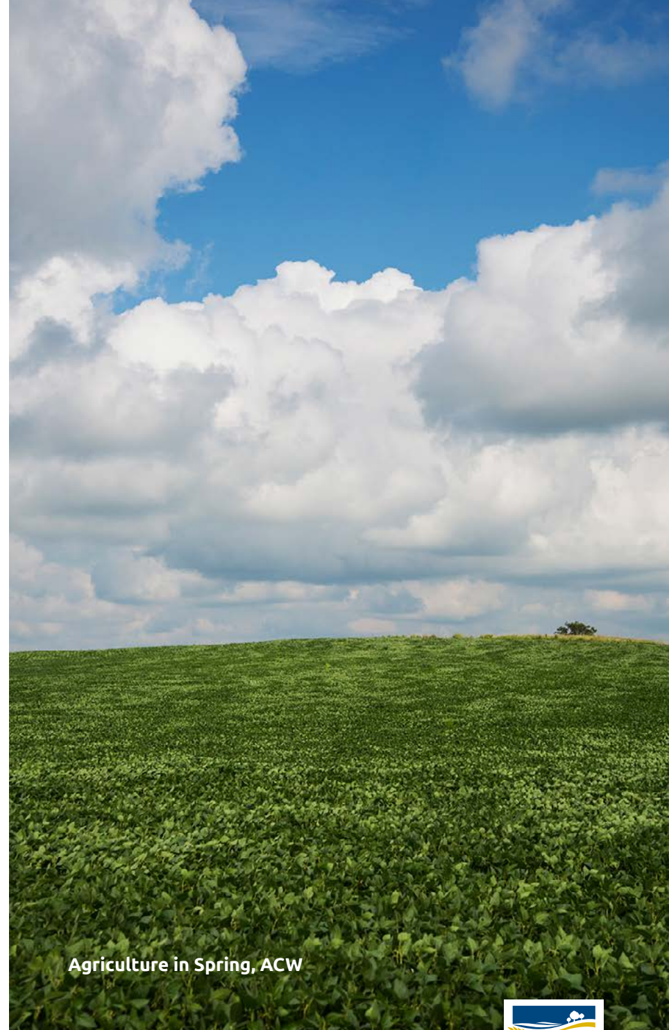
Agriculture in Spring, ACW